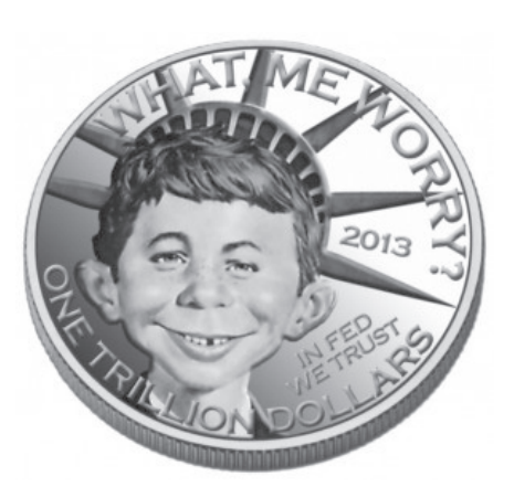
To claim your trillion-dollar coin, write to:

The S&P 500 index—now at an all-time high of 1,651 —hasn't gone much of anywhere in the last 12 years, but in 1990 it was at 340. In 1974 it was at 63! That is, it's multiplied 26 times in 39 years, and in every one of those years the companies within the index paid dividends.